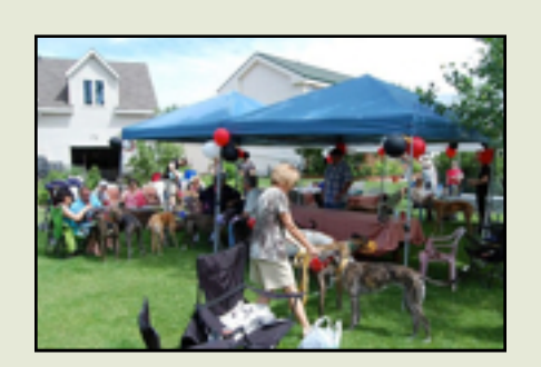
Tents provided great shade and the Greys had lots of space to run, play, and generally frolic by the Seine! The barbecue was hot, the drinks were cold, and the HSH community was out in full force.

picnic, and almost all of the food was provided by dog owners, so the majority of the funds raised went to the vet tab at Best Friends Animal Hospital.